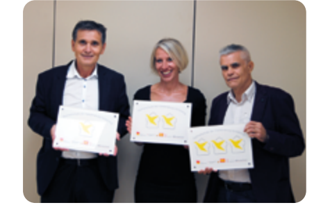
7 Days for Peace - Peace Education Program Awards for Partner Schools