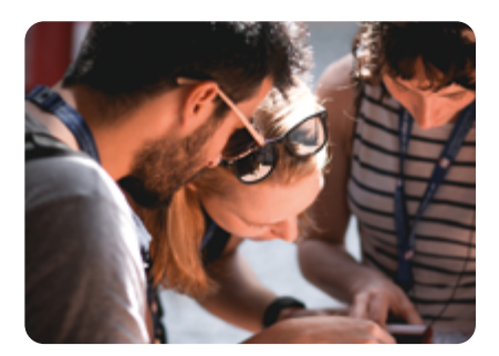
EPU & Training Alumni Network Worldwide