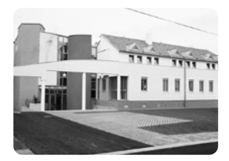
Haus International Student dormitory