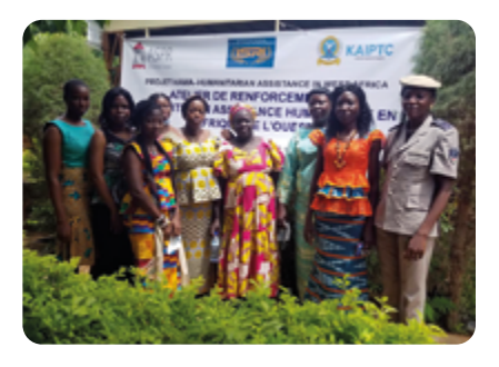
Course participants from the HAWA Multiplier Module in Burkina Faso