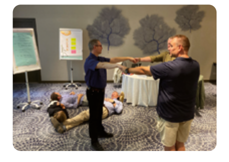
EUCTI Security Sector Reform Training Course in Somalia 2021

A wide range of expertise and practical methods, including on-site and online workshops